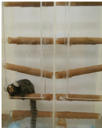
Figure 3. The marmoset in the tower setup.

performed in a double-blind manner by watching post hoc video-recordings of the animals accompanied by recording spontaneous locomotor activity in the lesioned animals [74]. Behavioral tests provide an external measure of PD-like pathology when assessing PD lesions in animals [71]. Evaluation of Parkinsonian features in marmosets can be conducted by a variety of behavioral tests ranging from simple food-retrieval task to a comprehensive neuropsychological assessment, including cylinder test, tower test (Figure 3), bungalow test, hand-eye coordination test, fear-potentiated startle response, rotation test, conveyor belt test, adhesive labels, reaching into tubes, staircase, hourglass test, bar grip power, and treadmill test (Table 4) [58,75-83].