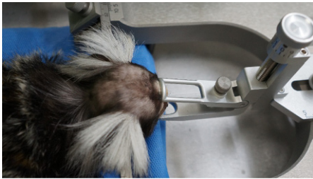
Figure 2. The marmoset in a stereotaxic frame for 6-OHDA injection.

hemisphere in the animals leaves the unlesioned side as an internal control, hence, fewer animals are needed in experiments to analyze behavioral deficits [9]. Along with less postoperative care for animals, local 6-OHDA treatment can minimize the risk of inadvertent toxic exposure for researchers associated with systemic MPTP treatments [49,64,65].